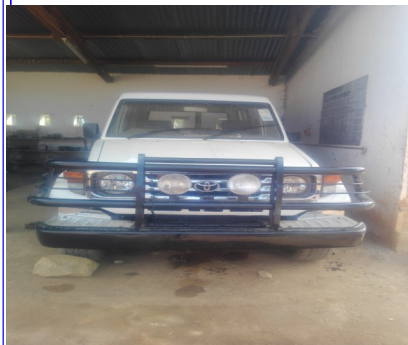
Bull-Bar done with maintenance and ready her sisters (other vehicles) for service

In a bid to ease mobility, the hospital embarked on vehicle maintenance starting with a Toyota Land Cruiser nicknamed Bull-Bar which was grounded for a long time. Maintenance of this vehicle will ease mobility especially when going to out-reach clinics. The maintenance involved fixing mechanical, electrical and vehicle body. The vehicle has been spray painted which has given it a new look. Another vehicle that has been fixed is a Toyota Hilux Ambulance nicknamed Press Trust which was involved in an accident a while ago. DGMH Management is grateful to the partners for the financial support for this project.