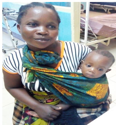
One of the child who gets nutrition support from DGMH

OVER-SEAS@PRESBYTERIANIRELAND ( overseas@presbyterianireland.org )