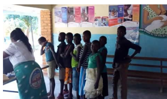
Children queuing for vaccines