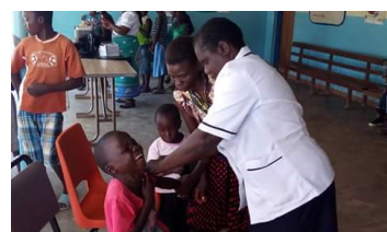
A nurse administering vaccine

DGMH has vaccinated 6,000 children in the Measles-Rubella Vaccination Campaign against the targeted 4,000, representing a higher percent coverage. The vaccination campaign covered the whole catchment area of DGMH.