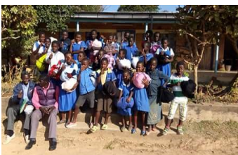
Children, Hospital Chaplain and Headteacher

Over 20 Orphan Children from Thunda Primary School were given clothes and shoes. The hospital wishes to extend sincere gratitude to friends from UK for sending clothes and shoes. The headmaster of Thunda Primary School was very grateful for the gesture.