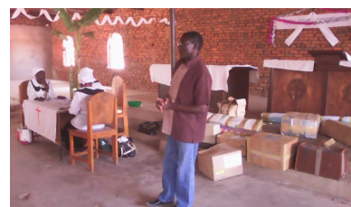
Chaplain briefing women guilds