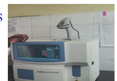
FBC at Lab

DGM Hospital has now a new Full Blood Count Machine courtesy of Livingstonia Hospital Partnership. The machine is used to count White blood cells, Hemoglobin, Red blood cell etc. The hospital used to send samples to other hospitals. The staffs and management are very grateful for the machine