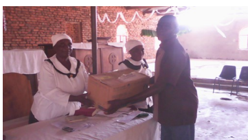
Chaplain handing over gifts

The Chaplain of the Hospital has distributed assorted items to Orphans and Elderly along Lake Shore area of lake Malawi. Various items were distributed to vulnerable and underprivileged people, blankets, beddings, sheets, clothes, soap etc. These are people from the areas of Mlowe, Luwuchi, Tcharo and Hara