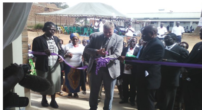
DCA Country director cutting ribbon as synod's GS and Moderator look.

It was all smiles for the people of Mwenemisuku in Chitipa District on 15th June 2016, as Dutch Church Aid and Norwegian Church Aid officially handed over Maternity wing and two staff houses at Msumbe Health Centre. The maternity wing has Labour room, Kangaroo room, Nursing room, waiting room. Equipment like Oxygen concentrators were also unveiled. Speaking at the ceremony, the Chief of the area said that people of the area were walking long distances to access health care services. He thanked Dutch Church Aid and Norwegian Church Aid for the development. The Health Centre is under DGM hospital.