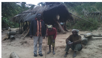
The Chaplain standing with a mother and her son behind is their house.