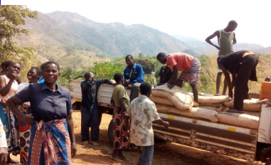
Farmers receiving Fertilizers

David Gordon Hospital through PHC department runs food security program with its aim to improve food availability in the catchment area. It has distributed fertilizers and seeds to farmers club in Chihanga area.