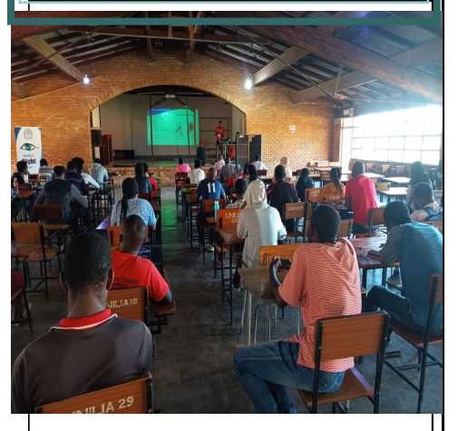
The picture above is the awareness campaign at the University of Livingstonia.

The hospital is also expecting to receive a new dental chair and other equipment from SMILE-AWI through a container which is in transit to Malawi.