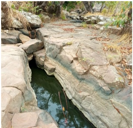
The above pictures show the sources of water in some most of the areas.