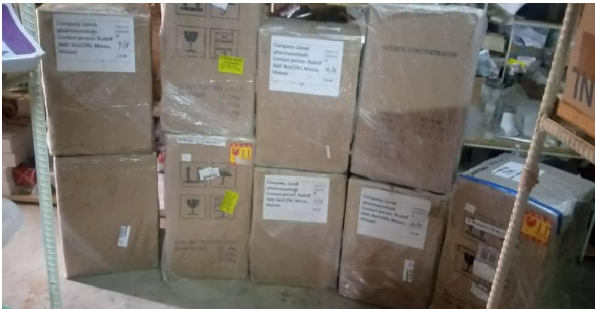
Figure 1: all the 9 oxygen Concentrators in one picture being delivered at DGMH pharmacy

Nine Oxygen concentrators were bought from INTERMED and ZANACK PHAMARCEUTICALS in Mzuzu. The plan is to be used at DGMH and all the Health centers. Currently we have delivered one at Mlowe health Center and Luwuchi Health Center. We are remaining with 7 at the stores.