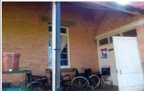
The Veranda at the Female Ward