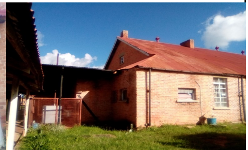
behind the Theatre

The above pictures shows the current condition of the hospital buildings. There is need to repair the leaking roofs and replacing ceilings. Plumbing systems need to be overhauled and the floor of other buildings need to be maintained.