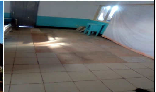
The floor at Male Ward