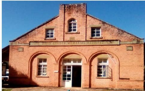
The face of the hospital.

Some of the buildings need to be modified to fit the purpose of the hospital. The pictures down show the general condition of the hospital: